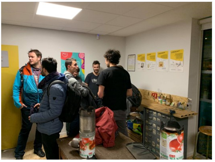
Photo: The Inauguration of the local Low-tech Lab of Grenoble, 2020"

Throughout this event and the following ones (meetings, workshops, stands...), don't hesitate to take pictures! This can always be come in handy when promoting projects and communicating on your activities. Be careful, however, make sure to gain permission and rights in order to use images with identifiable people present.