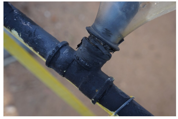
Étape 5 - Assembly