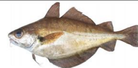
Tacaud commune Trisopterus luscus