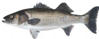
Bar Dicentrarchus labrax