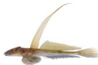
Dragonnet lyre Callionymus lyra